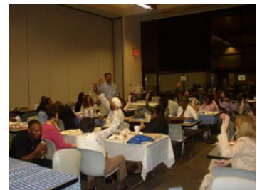
"Greet and Meet" at Wake County Commons on May 17, 2006.

Evacuees were excited to see and renew acquaintances they had not seen since being evacuated to the shelter when first arriving in Raleigh. Some took the time to renew friendships from New Orleans. There was also an opportunity for individuals to enroll in the Katrina Project.