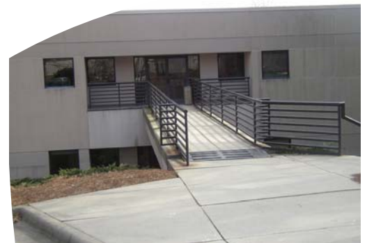
Capital Area's new office location

Please feel free to join us for the open house. We look forward to seeing you there!