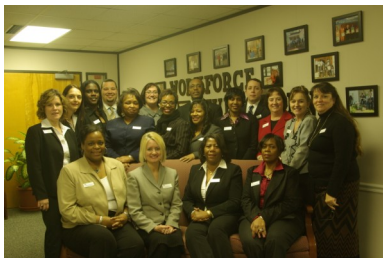
Capital Area Staff