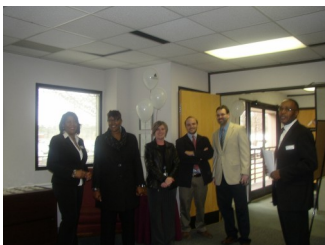
The first group of visitors are welcomed

Feedback indicated that a great time was had by all! The planning committee did an outstanding job.