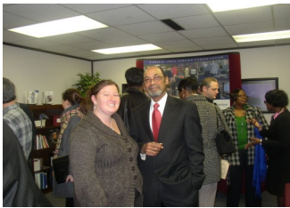
Our friends from Division of Workforce Dev.

This was definitely not your average open house. Yes, there was a lot of good food, but so much more! One hundred twenty-five people from partner organizations, contractors, and the business community flowed through the halls of the new office this past January. Guided tours were provided by Access JobLink AmeriCorps members and information booths featuring programs and services were set up in order to help those in attendance learn about what we do and the key staff members involved.