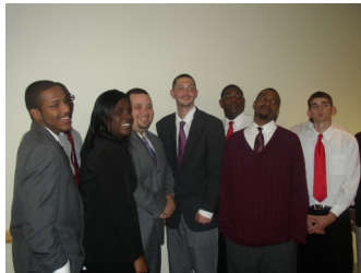
Youth participants and staff members

The Sebelius Pacesetters Youth Chamber of Commerce Chapter teaches order, business etiquette and protocol, plus financial and budgetary strategies through specific business projects and technology training. Youth members participate in business development and learn what customers expect and how to consistently provide services that meets those needs.